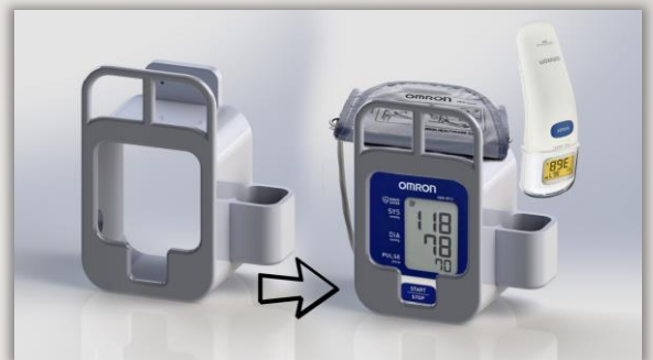
3 printed model: BPM and thermometer holder