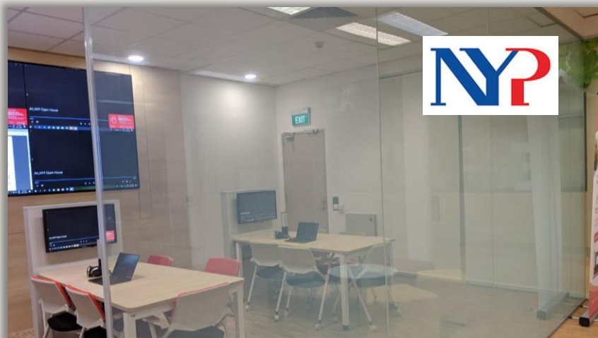
Deployment at Telehealth Centre