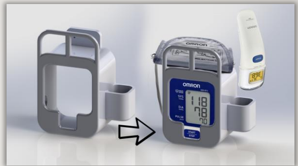
3 printed model: BPM and thermometer holder